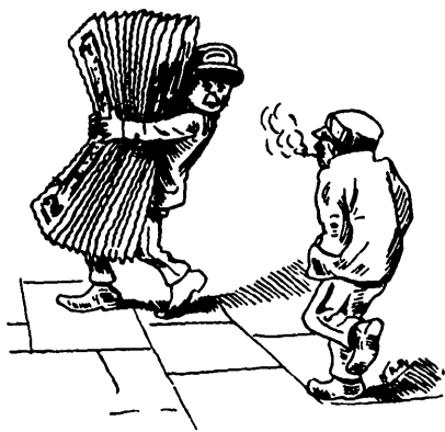
THE NEW COLUMBIAN ISSUE.