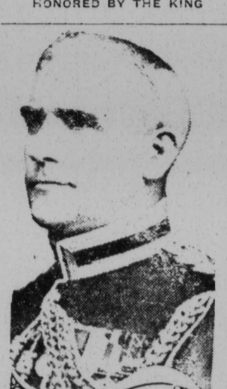
HONORED BY THE KING Sir Sam Hughes, Canada's Minister of Militia

"Pape's Diaphepsin" makes Sick, Sour, Gassy Stomachs surely feel fine in five minutes. If what you just ate is souring on your stomach or lies like a lump of lead, refusing to digest, or you belch gas and eructate sour, undigested food, or have a feeling of dizziness, heartburn, fullness, nausea, bad taste in mouth and stomach-headache, you can get blessed relief in five minutes. Put an end to stomach trouble forever by getting a large fifty-cent case of Pape's Diaphepsin from any drug store. You realize in five minutes how needless it is to suffer from indigestion, dyspepsia or any stomach disorder. It's the quickest, surest stomach doctor in the world. It's wonderful.