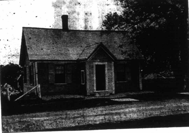
THE PAGAN BUILDING ON MONTAGUE STREET, ST. ANDREWS