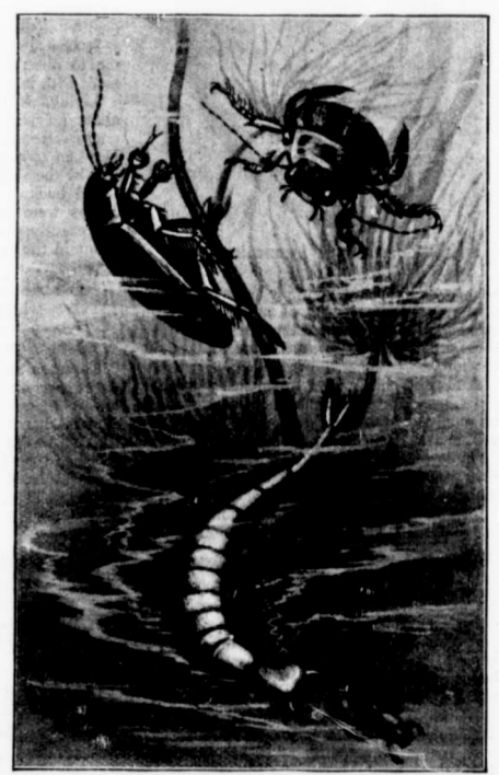
DYTISCUS MARGINALIS AND LARVA. (Natural size.)

When growing wild, succory presents little beauty in its leafage; its stiff, wiry stems spring up out of the hard chalky soil which it prefers