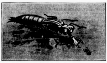
DRAGON-FLY PUPA. (Natural size.)

and into which it sends down a long taproot in order to collect all possible nutriment and moisture. Even its lovely sky-blue flowers have a tantalising way of growing without stalks, one here and one there,