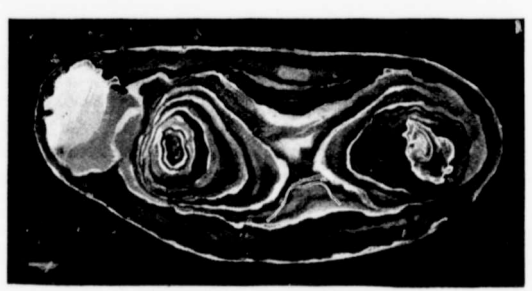
POLISHED QUARTZITE PEBBLE.

If we like to experiment with a piece of amber and apply it to a candle, it will burn, giving out a rather disagreeable odour and