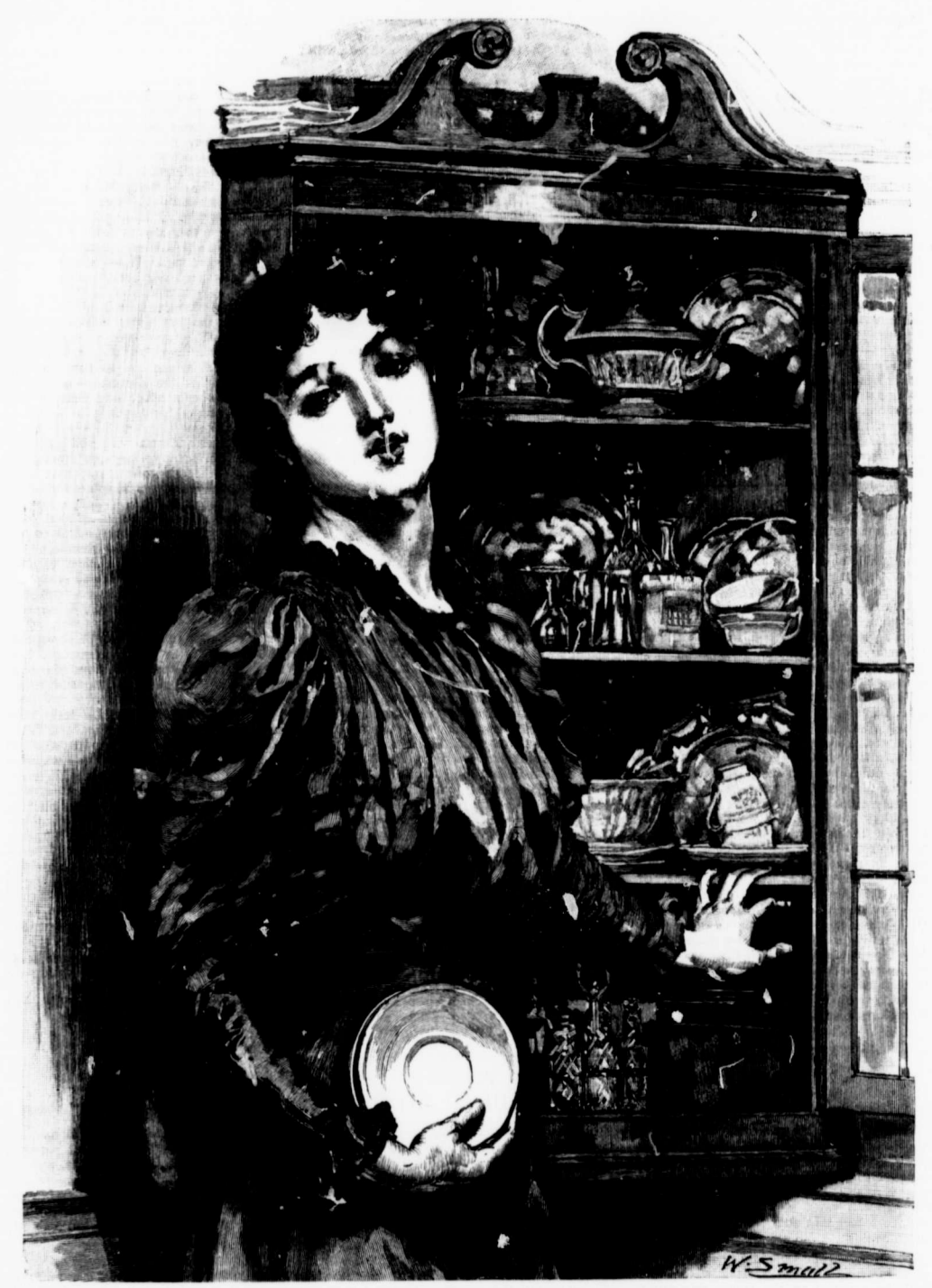
THE CHINA CUPBOARD.