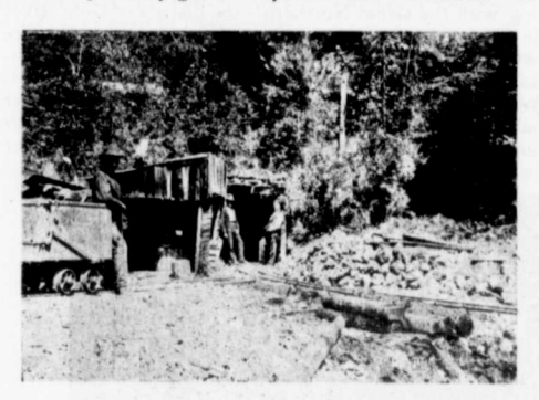
NO. 1 TUNNEL, ALICE MINE, CUTTING LEDGE AT 100-FT. LEVEL.

On the St. Patrick Group of claims, owned by Messrs. Couch and Sloan, and situated at the base of Goat mountain, there is a vein 20 feet wide. Sufficient work has not yet been done to arrive at any conclusions as to the values in this vein, although it is highly mineralized and exceptionally good assays have been obtained. A