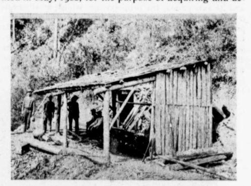
No. 2 TUNNEL, ALICE MINE, CUTTING LEDGE AT 250-FT. LEVEL.

The Valparaiso Gold Mines, Limited, was incorporated in May, 1900, for the purpose of acquiring and de-