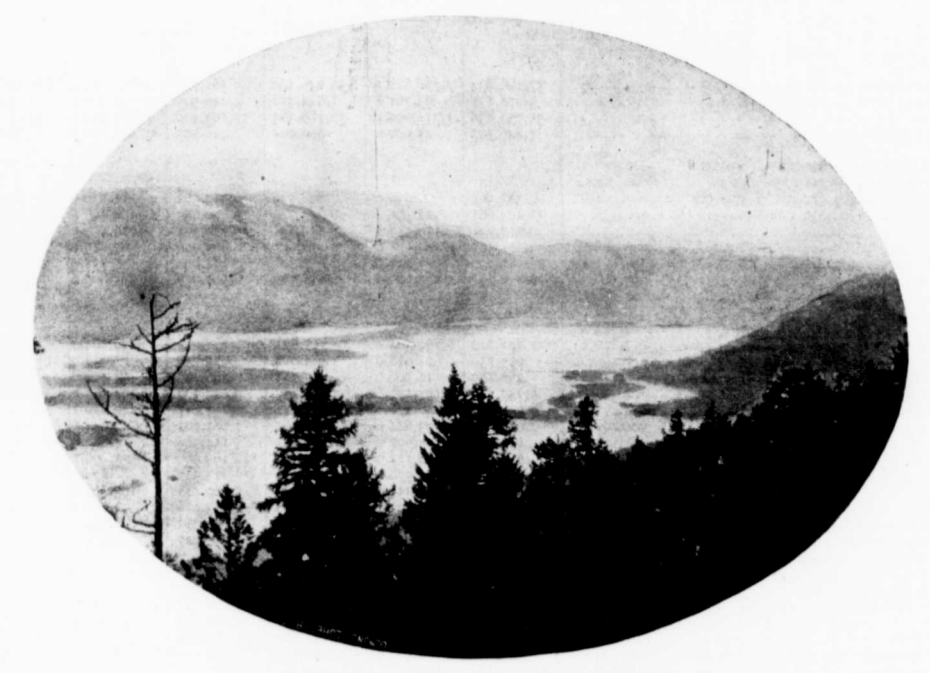
VIEW OF KOOTENAY FLATS FROM ALICE MINE, GOAT RIVER MINING DIVISION.

The continued large production of silver and its causes have heretofore been referred to in our columns. There is every reason to believe that the world's mines will keep on turning out the white metal, and that no large decrease need be expected, unless a very considerable fall in price should occur; and there is no reason to expect such a change under present conditions.