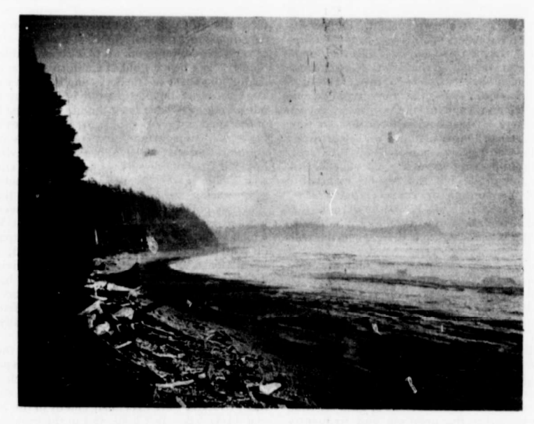
SHORE LINE-WRECK BAY PLACERS-WEST COAST VANCOUVER ISLAND,

As far north as Washington the indications of gold are shown by the black sand, a combination of magnetic iron and hornblende, but going north of Puget Sound, it is found that a new mineral enters into the strata containing the gold, of a much more distinctive colour, viz., broken garnets and pink topazes, giving the colour to the ruby paystreak generally associated in the minds of Alaskan miners with the existence of gold in paying quantities.