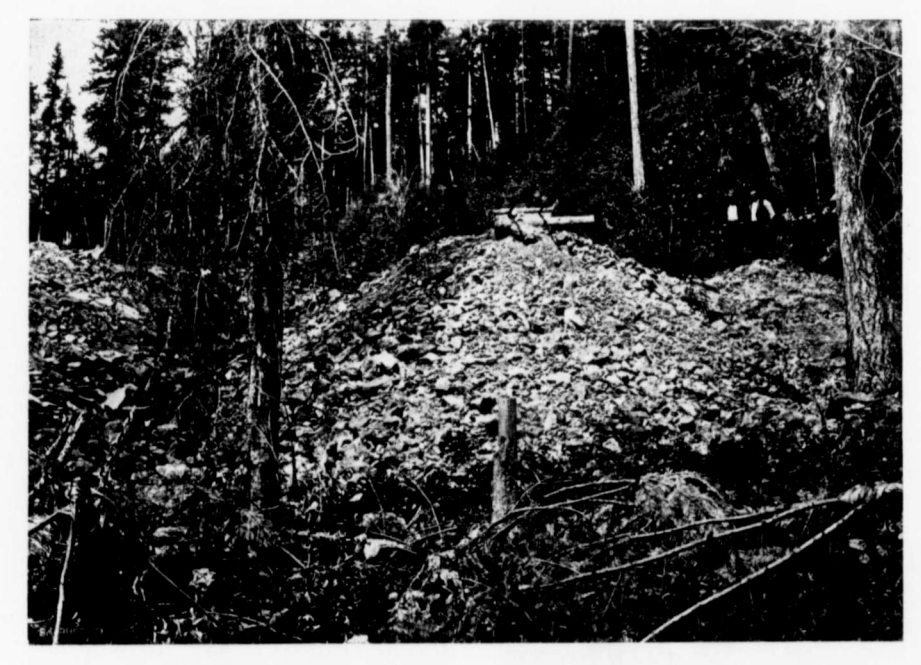
ORE DUMP ALICE MINE, CRESTON, NO. 1 TUNNEL, GOAT RIVER MINING DIVISION.

built partly at the expense of the government, and partly at that of the York and Lancaster Syndicate, which is to be improved this year so as to make both a good winter and summer road. The property will not become productive on any very large scale until an ærial tramway and a concentrating plant have been installed in connection with it. Under the stimulus of railway construction, two railways running through the district one the main line of the Crow's Nest Pass railway and the other the Nelson & Bedlington branch connecting with the Great Northern-the district of Goat River is coming to the front again. During last year there were 303 certificates of work recorded, 261 claims located, 137 bills of sale and bonds recorded, and 11 certificates of improvement issued, which marks a distinct advance over recent years. The London & British Columbia Goldfields, Ltd., has several properties under