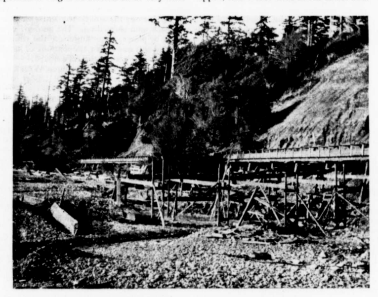
Flume-Wreck Bay Placers-West Coast Vancouver Island Mining Division.

The "Ordinary" Tom pattern has amalgamated plates. The sand is dumped from a barrow on the "spreader," which is 11 feet long, 2 feet wide at the upper, and 6 feet wide at the lower end. It then drops