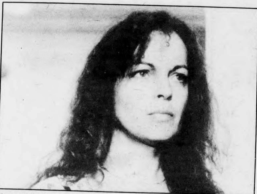
Romy Schneider as Death Watch's Katherine Mortenhoe.