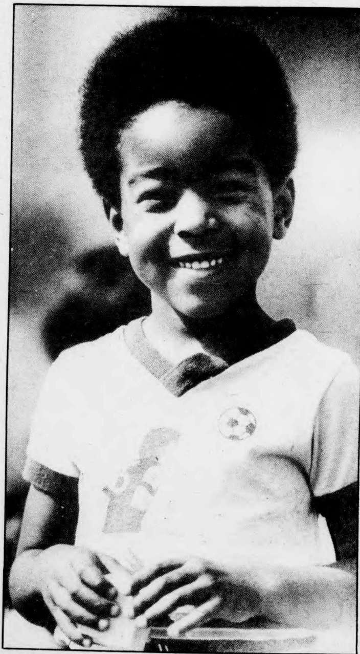
Photograph by Himbara

The discussion did not center only around the international areas, it also focussed on some domestic problems. One member of the audience spoke very passionately about some of the mistreatments which occur in psychiatric institutions in Canada.