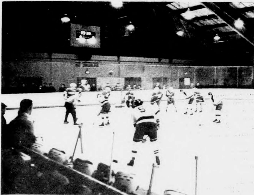
And now, fans, a remarkable example of powerful optical principles -- just FLICK your eyes from photo to photo and watch amazed as the players LEAP FROM THE PAGE.