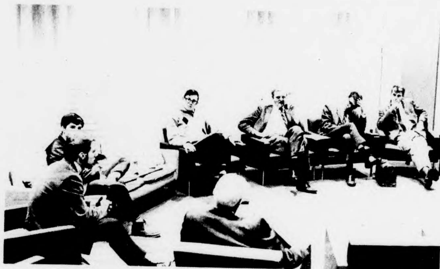
Interested S.R.C. panel members at discussion on Democracy at York

One of the major criticisms aired was that the university is presently run much the same as a business corporation with a self-perpetuating Board of Governors, not responsible to either students or faculty, made up not of noted academics but mainly of prominent business men.