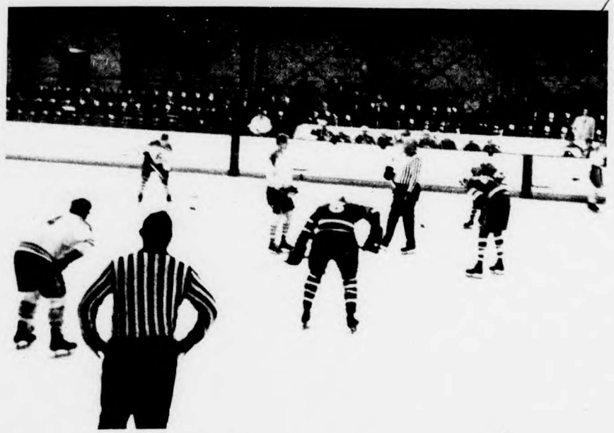
Hockey is the fastest game on earth.