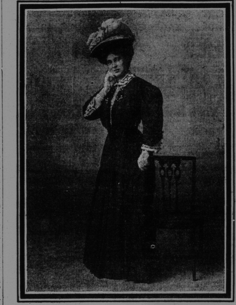
MODISH ETON SUIT IN HELMA CLOTH.

Like the separate blouse, the death knell of the little eon jacket has been sounded so often that we have ceased to take any notice whatsoever of such pronouncements on the part of self-appointed fashion censors. Because of its universal becomingness and the comfort that its abbreviated shape affords once the warm weather has started there is no let-up or warning to its smart acceptance.