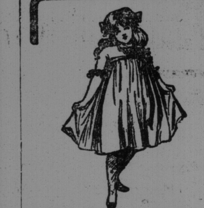
The Growing Girl