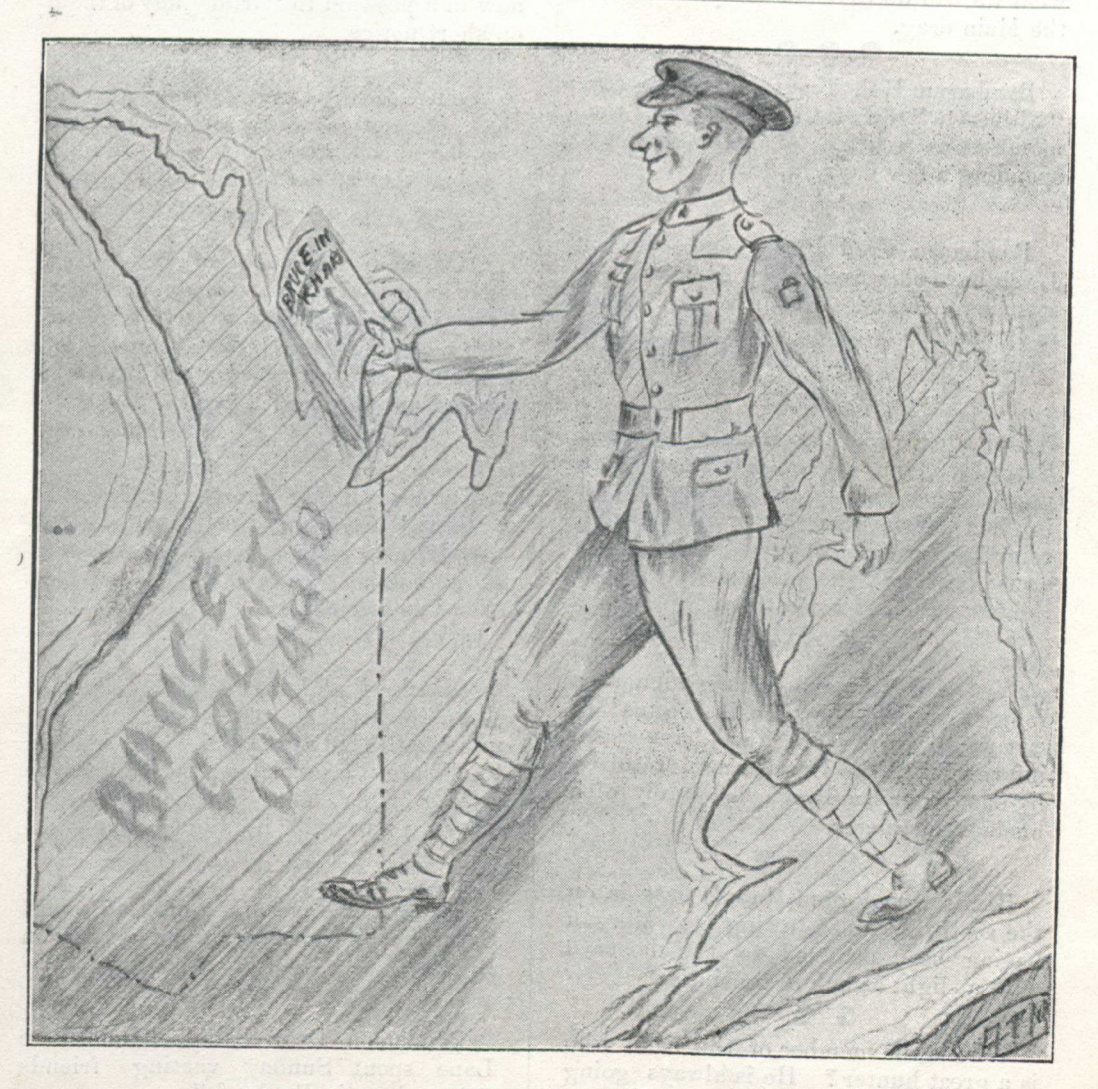
WELCOME NEWS FROM OVERSEAS