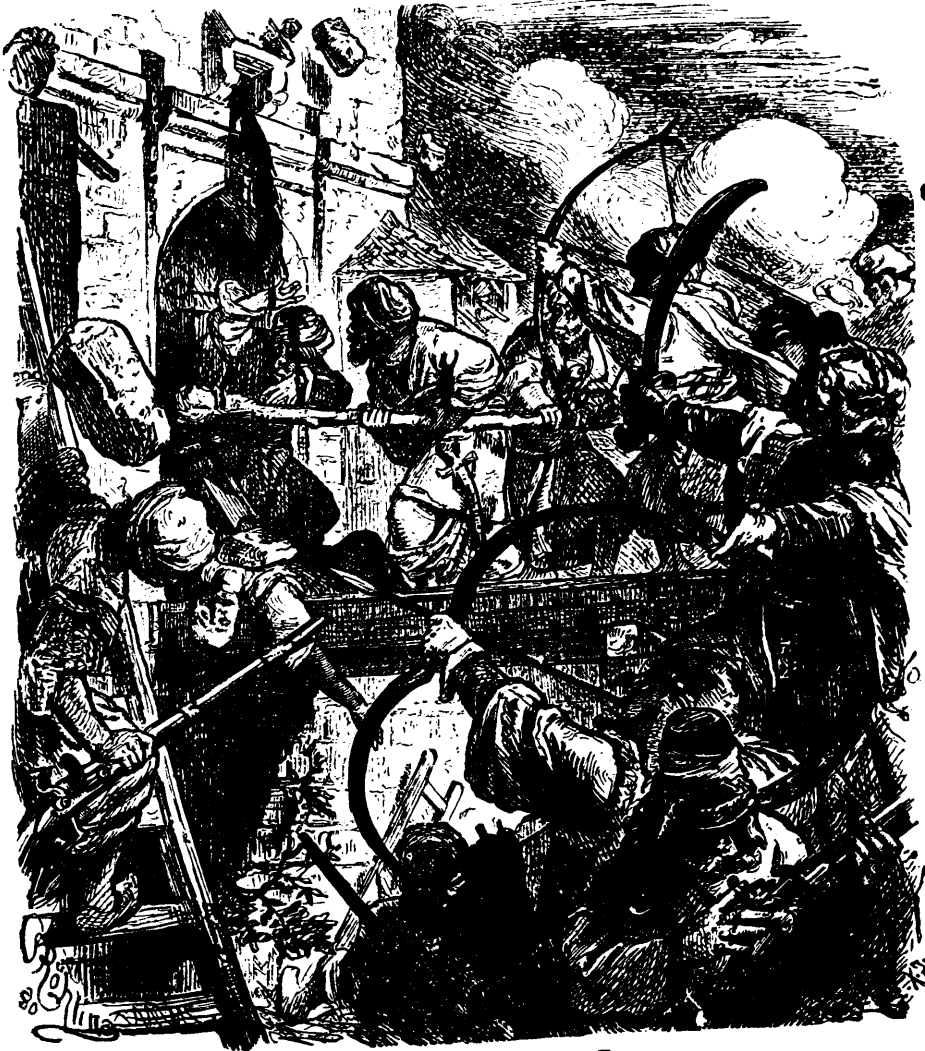
STORMING A CASTLE.