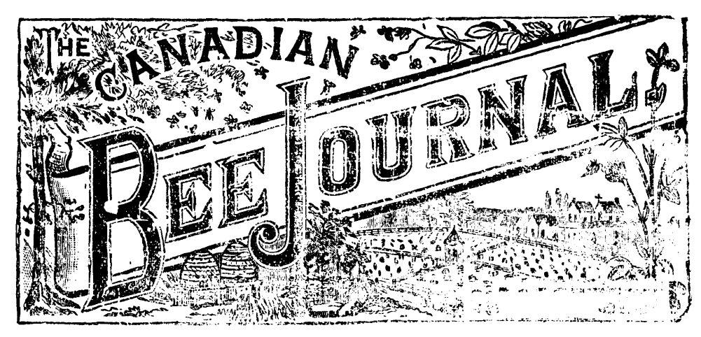
"The Greatest Possible Good to the Greatest Possible Number."