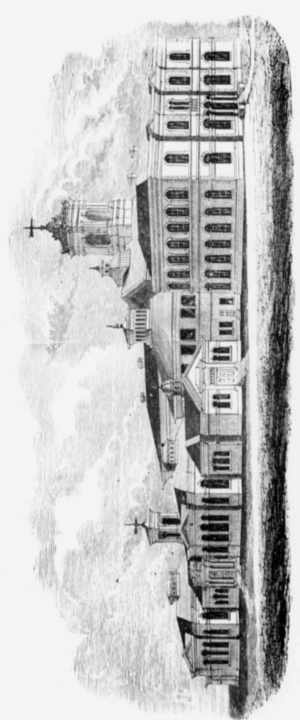
THE EDUCATION DEPARTMENT AND NORMAL AND MODEL SCHOOLS, TORONTO, Showing Doctor Ryerson's Office in the south-west angle of the Main Building.