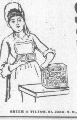
SMITH & TILTON, St. John, N. B., Agents for New Brunswick.

BUCKEYE BELL FOUNDRY. BUCKEYE BELL FOUNDRY. BUCKEYE BELL FOUNDRY.