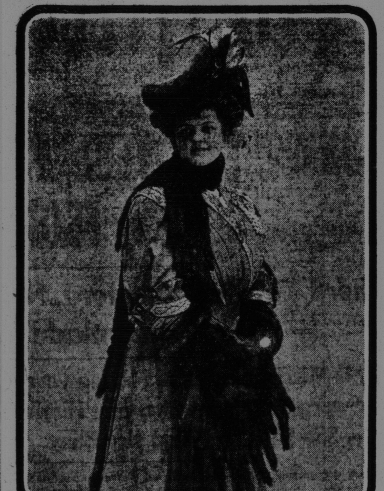
MINK THE FASHIONABLE BROWN FUR.

Quite the prettiest and by far the most serviceable of the fashionable brown furs is mink. The mink muff is the newest... This, like the long stole, is trimmed with the tiny paws and many small tails. The small dressy hat with Irish lace crown has mink trim and trimmings of brown, and white coque feathers. The costume worn with this three-pieced fur set is a wonderful, hand-drawn frock of novel tan and deep half-way to the elbow. This, like the long stole, is trimmed with the tiny paws and many small tails.