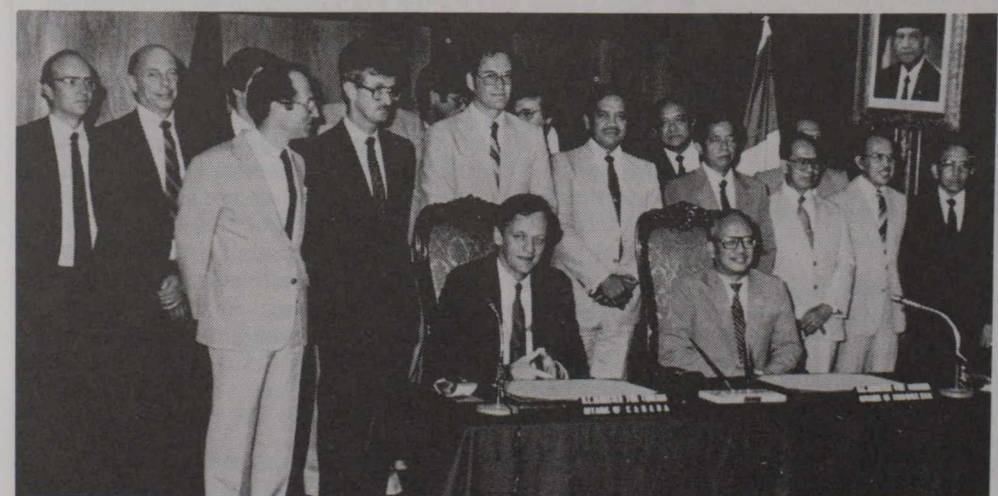
Canadian and Indonesian delegations meet to sign agreements.

The program for the Indonesian visitors was quite intensive and varied. During their stay in Ontario, for instance, the mission visited the Ontario Institute for Studies in Education, three technical colleges, three universities, a management training institute, a management consulting firm, an educational services firm and the headquarters of the International Development Research Centre (IDRC). Similar visits in the other three provinces gave members an excellent overview of Canadian systems, institutions and approaches in the field of education and training.