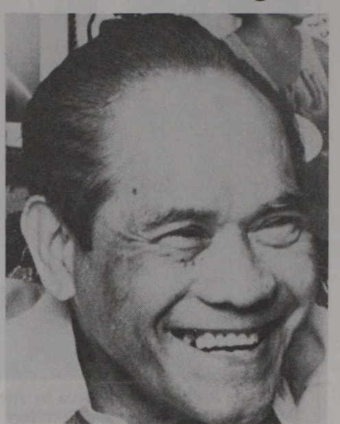
Minister of Foreign Affairs A. Tolentino.

Arturo Tolentino is not new to foreign affairs, nor to ASEAN. As Minister of State for Foreign Affairs in the Interim Batasan Pambansa, he attended several ASEAN Ministerial Meetings and was one of the three Philippines Representatives on the ASEAN Task Force. He is best known to Canadians, however, for his able contribution, notably on the Archipelago Doctrine, to the work of UN Conferences on the Law of the Sea-where his cooperation was much appreciated by successive Canadian Delegations. In the Philippines, he is most widely respected for his long time service