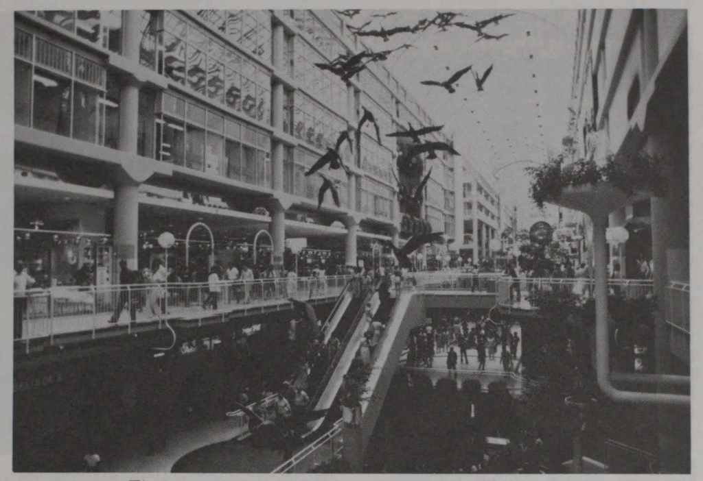
Eaton Centre, Toronto

The stars and planets are on display daily at the McLaughlin Planetarium on Avenue Road just south of Bloor. The adjacent ROM – Royal Ontario Museum – has now reopened after extensive renovations.