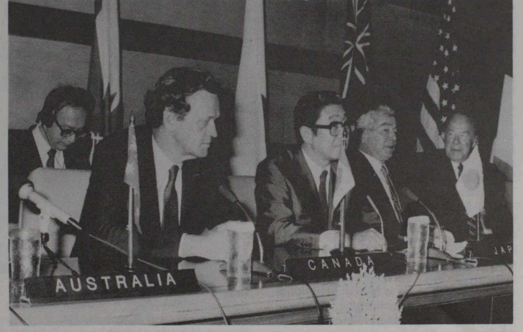
The Honourable Jean Chretien, Deputy Prime Minister and Secretary of State for External Affairs, (left) is shown with his counterparts from other dialogue countries attending the Post-Ministerial Conference with ASEAN Foreign Ministers.

Foreign Minister Chrétien also endorsed ASEAN's proposal for the establishment of Pacific Economic Cooperation, a non-institutionalized scheme to increase awareness of fundamental