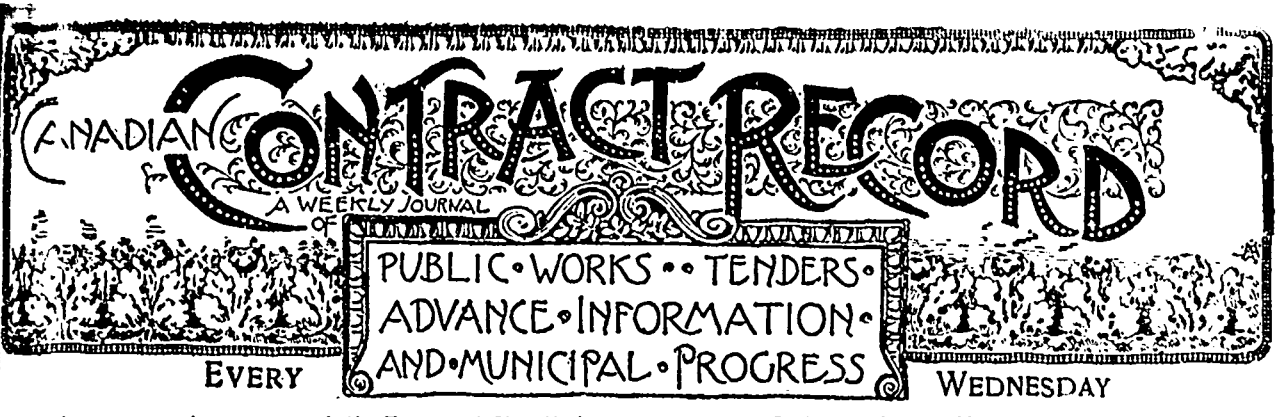
This paper reaches every week the Town and City Clerks, Town and City Engineers, County Clerks and County Engineers Purchasers of Municipal Debentures and leading Contractors in all lines throughout Canada.