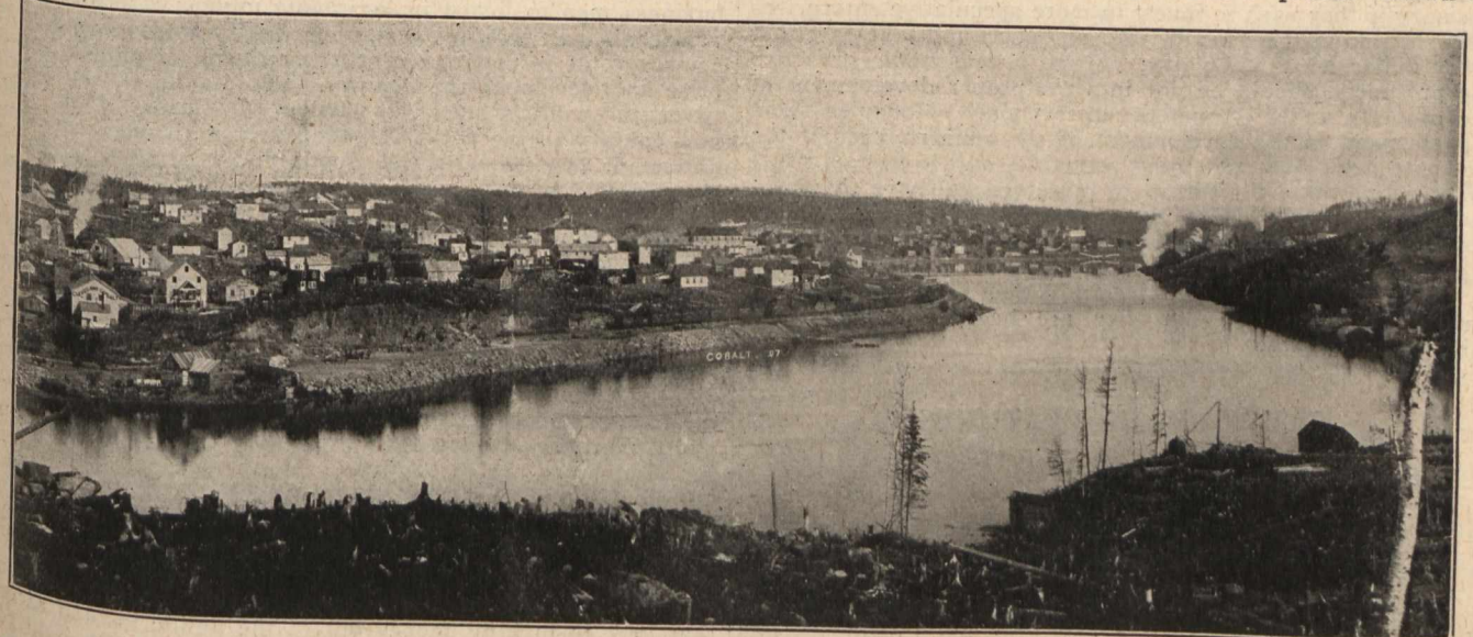
Bird's-eye View of Northern Ontario's Silver Camp—a demonstration of the power of mineral as a town grower.

both horizontally and vertically. In regard to the value of ore which the camp will produce, let us suppose that all the veins at present known on