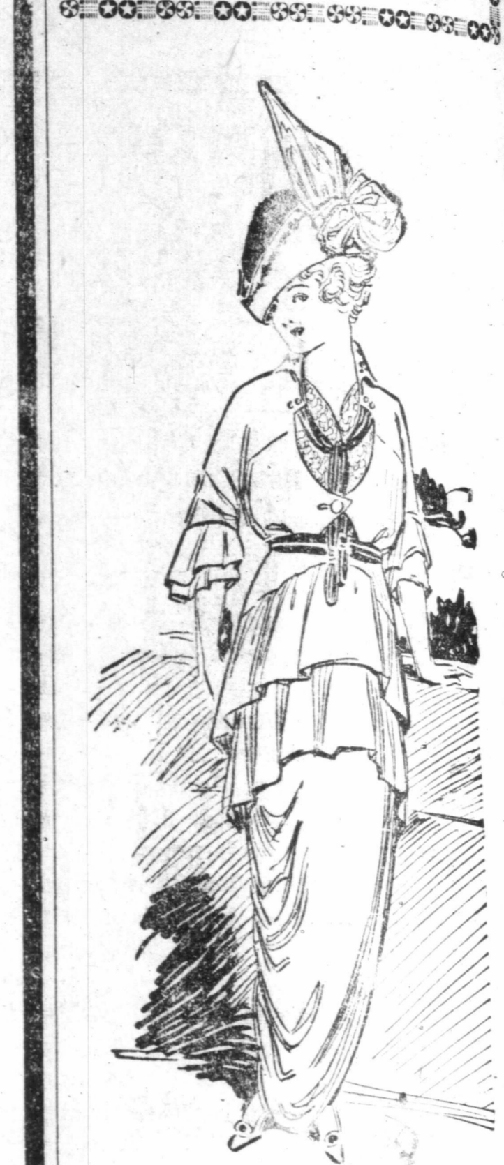
POPLIN FOR SPRING DAYS

For this smart coat dress silk and wool poplin in a shade of bronze has been used. The blouse buttons over a waistcoat of lace and ties of bronze colored satin are draped across it. The narrow rolling collar of cream taffeta is embroidered in Cubist design and colors. A double ruffle or tunic hung from a hip yoke deepening toward the back serves to produce the desired silhouette while the three-quarter sleeves are distinctly bell shaped. With this is shown a smart hat of cream straw, with crown of black satin and wing-like bow of moire trimming effectively.