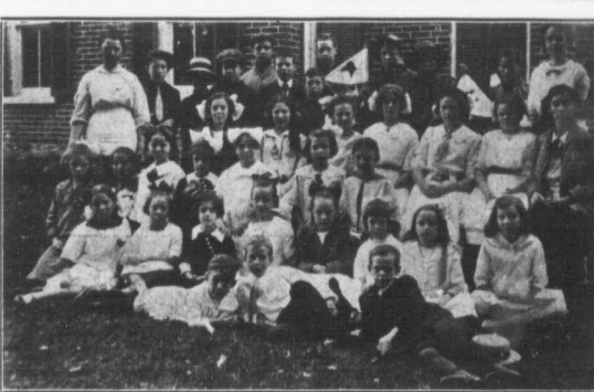
THE JUNIOR LEAGUE OF UXBRIDGE, ONTARIO.

Christmas is, and should be, a season of joy; of home comings of those who have wandered from the old roof tree in search of fame or fortune; of reunions of parents and children, kindred and friends. If we would make our Christmas the gladdest, happiest day of all the year, it is by thoughtful planning for others that we shall accomplish it. If we are away, our thoughts naturally turn first to the dear ones at home from whom we are separated. Whether or not remember them with the customary