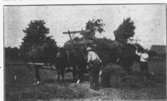
THE HAY HARVEST.