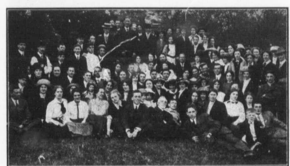
ELM STREET LEAGUERS ENJOYING AN EVENING OUTING.

not registering ..... Second night, Nov. 16.—Programme by girls of Y.W.C.A.: 0ld members present 162 New members received 44 Visitors present 109 Members, etc., too late to count or not registering ..... 339 Third night, Nov. 23.—Literary: Old members present ...... New members received ..... 95 not registering ..... 215