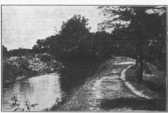
BY THE BROOKSIDE.

When our missionaries returned to Szechwan, after the Boxer riots, they found the mission property unharmed and the people friendly. From that day our work has grown in all departments, From that day and throughout the districts of Szechwan assigned to us as a mission field.