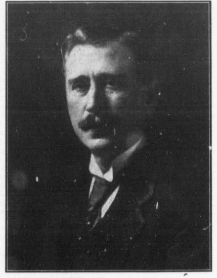
THE HON. W. H. HEARST Premier of the Province of Ontario

Not only have statesmen, soldiers and seamen been spurred by love of country to give the best that was in them, but our loftiest songs and noblest verse have been produced under the same influence; and while there have been patriotic blunders as well as patriotic triumphs, it never-