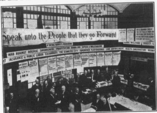
A SECTION OF THE SOCIAL SERVICE EXHIBIT AT GENERAL CONFERENCE.

rural welfare, woman's suffrage, direct legislation and vocational training and