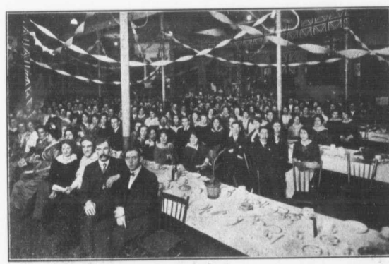
THE ELM STREET LEAGUE BANQUET, HELD DECEMBER 14TH, 1914.

The constable in a small town received by post six "rogues' gallery" photographs, taken in different positions, of an old offender wanted for burghary in a neighboring city. A fortnight later the constable sent this message to the city chief of police: "I have arrested five of the men, and am going after the sixth to-night."—Ex.