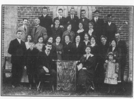
THE CONESTOGO LEAGUE, BANNER BEARERS OF GALT DISTRICT.