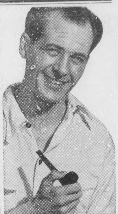
I've taken to pipe smoking like a prof to knowledge since l've discover ed sweet, cool, mild Picobac.

Yea, didst Daddie, Duke of Dork, c receive rebuke from Ham-of-Belling for report on lady of luv in earlier copy who dost write long tabloids of passion pantings resultin orgy of horrid stuff known to the pure form for that individual Doins few as study, and Daddie dost drag- who apparently is too lazy or not bag well lubricated with oil of intelligent enough to figure the Highland teachers across floor in rest of the column out-Our other