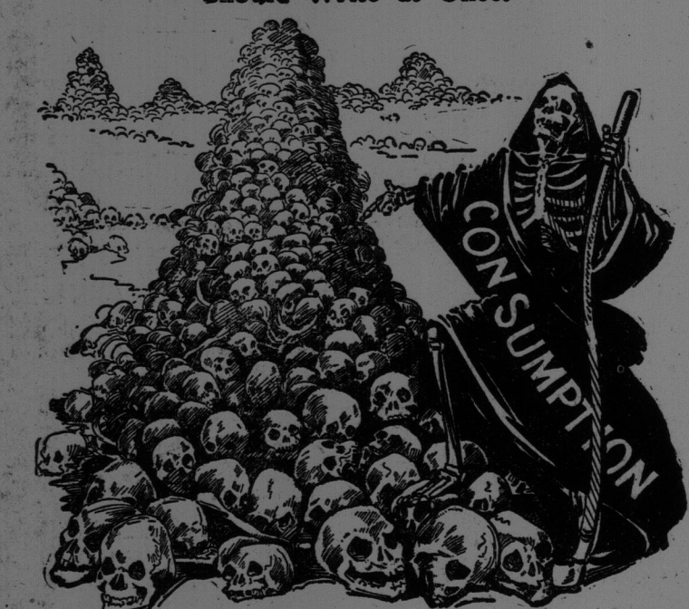
Consumptions Daily Monus Every 30 Seconds, Someone Dies From Consumption 2 Die Each Minute 220 Each Hour, 2,880 Each Day, and 1,000,000 Each Year.

Every Man and Woman Suffering From Consumption, Bronchitis, Asthma, Catarrh, Hacking Cough and Throat or Lung Trouble Should Write at Once.