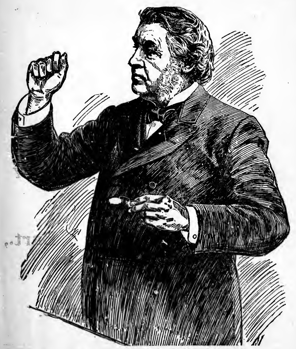
SIR CHARLES TUPPER, BART.