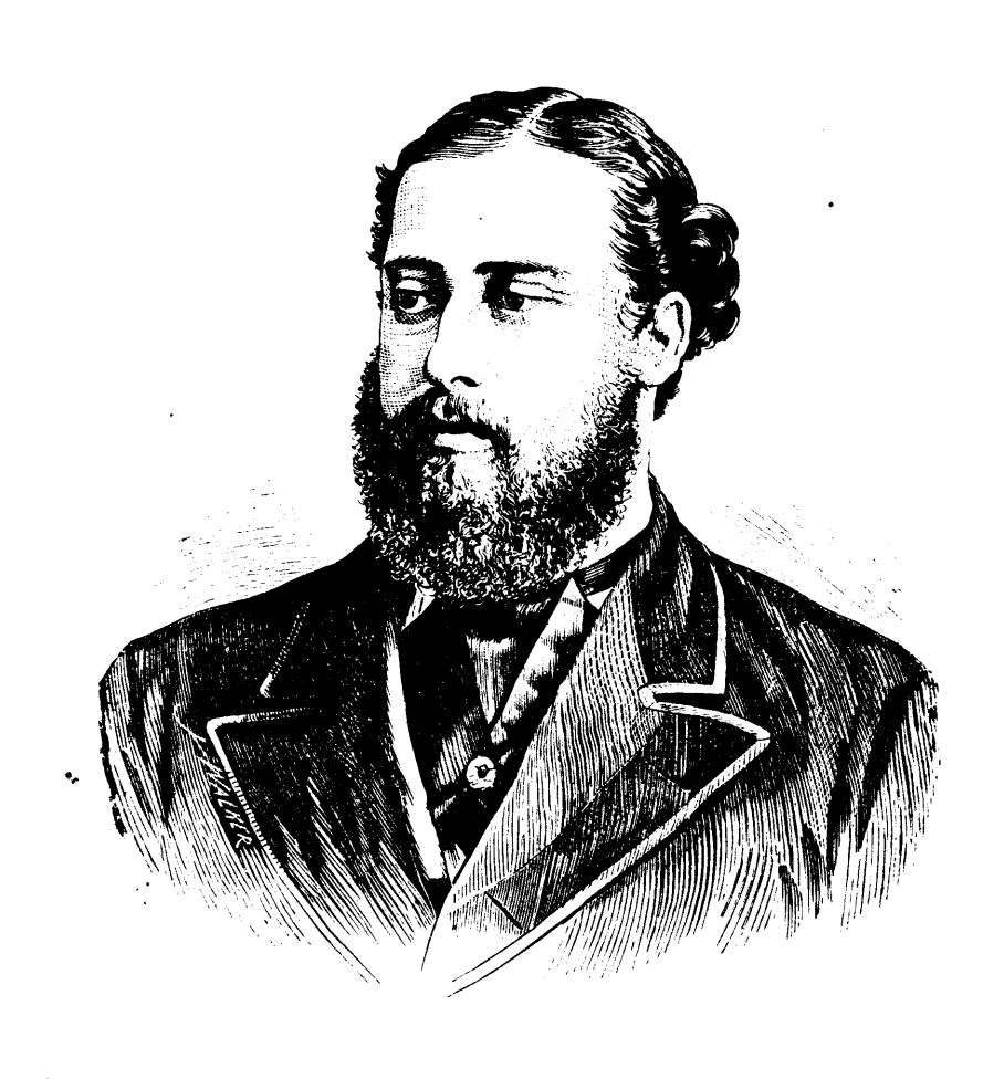
H. R. H. PRINCE OF WALES.