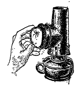
EGG TESTER. Showing a good fertile egg after five days of incubation.

The principal object of testing is to watch the development of the air cell, and to remove bad or dead eggs. By keeping out dead or infertile eggs, the operator runs no risk of getting the thermometer on a cold egg and overheating the lives ones. The removal also aids in keeping the air pure.