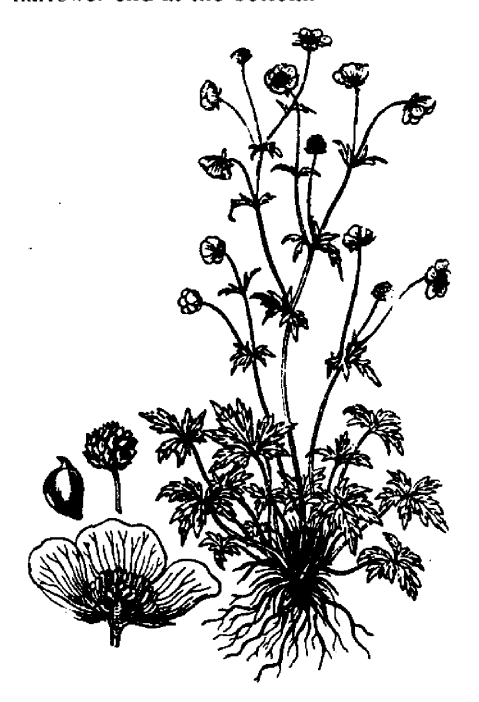
Fig. 99.—RANUNCULUS ACRIS (Fall Buttercup).

It will be important that those readers who are not familiar with the names of the different parts of flowers should carefully familiarize themselves with them as above described, as in future it will be taken for granted that the reader knows what is meant by these terms.