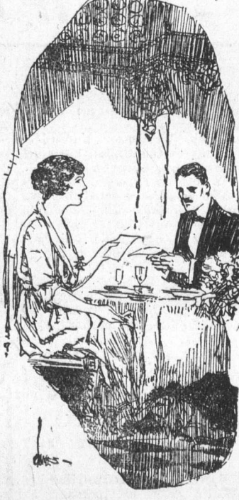
"You Ancient Scoundrel!"

emotions in which disappointment and amazement appeared to predominate,