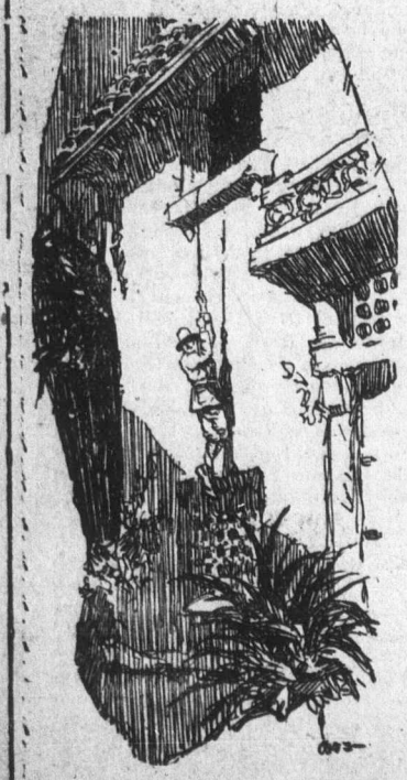
He Lowered Himself Out of the Win

with Andrew." He looked at his watch—eleven-Hurriedly he dressed, strapped on his automatic pistol, dragged his bed noiselessly to the open window and tied to the bed-leg the rope he used to lash his trunk; then he low-