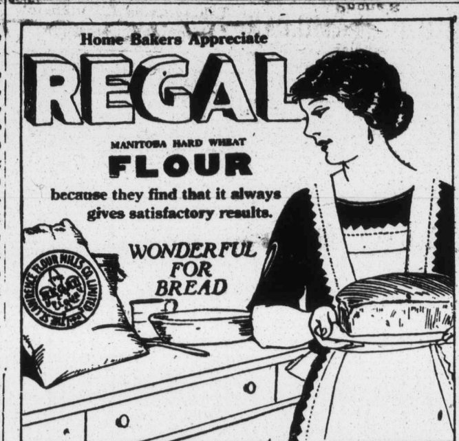
Sold in Newcastle by Stothart Mercantile Co., Ltd.

WEDNESDAY HALF HOLIDA It is reported that a number of Newcastle merchants are adverse to the Wednesday half holiday this Previously acknowledged ...23015.36 year and it is questionable whether or not it will be kept during on months