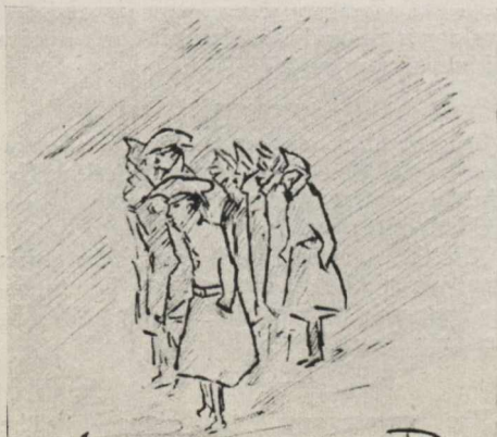
ANOTHER HOPELESS DAWN,

"Should an Officer remove his cap when he enters a private house?" An Officer urgently desires to know.