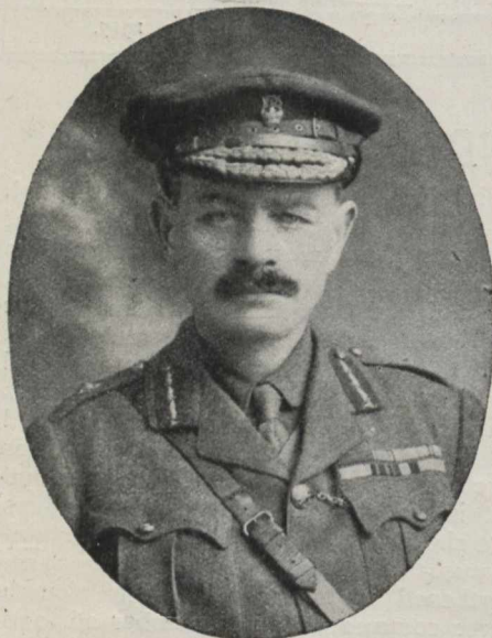
LIEUT.-GENERAL THE HON. SIR JULIAN BYNG, K.C.B., K.C.M.G., M.V.O., COMMANDING THE CANADIAN CORPS.

Lieut.-General the Hon Sir Julian Byng, K.C.B., K.C.M.G., M.V.O., commanding the Canadian Corps, evinces a keen interest in the work of the school.