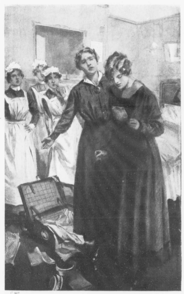
IT WAS HER OWN FACE THAT STARED AT HER FROM THE PICTURE