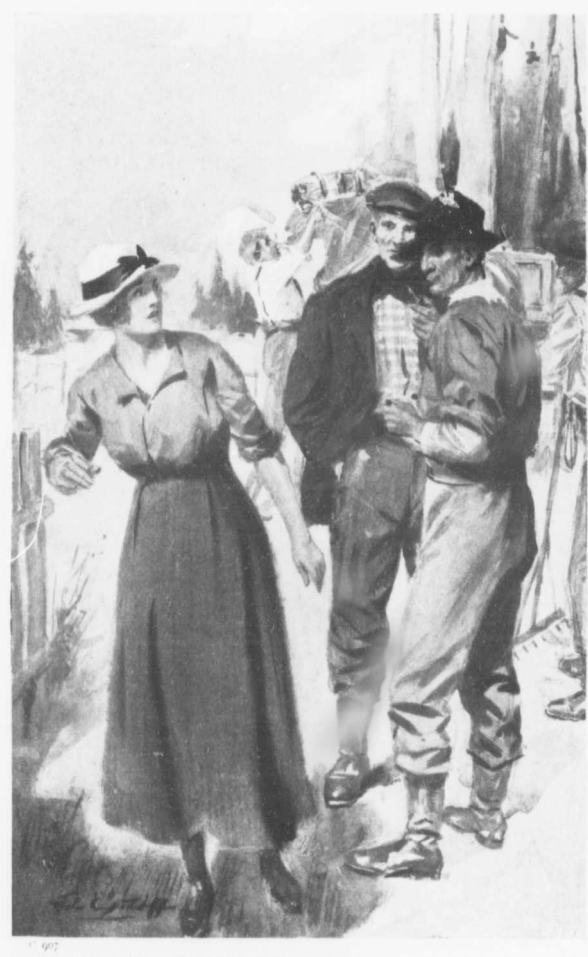
ONE STARTLED LOOK SHE GAVE HIM, THEN TURNED HER HEAD $\operatorname{QUICKLV}$