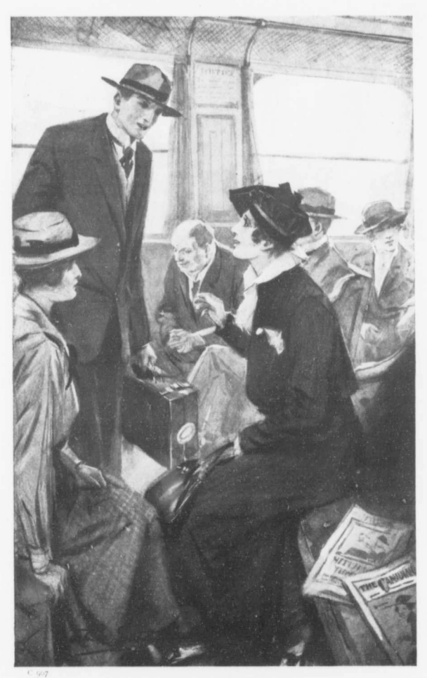
"ARE YOU HERE?" SHE CRIED