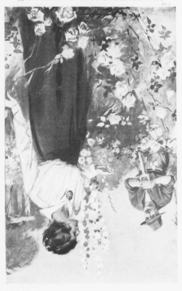
", PRAY, WHY SHOULD NOT I GATHER ROSES IF I WISH?"