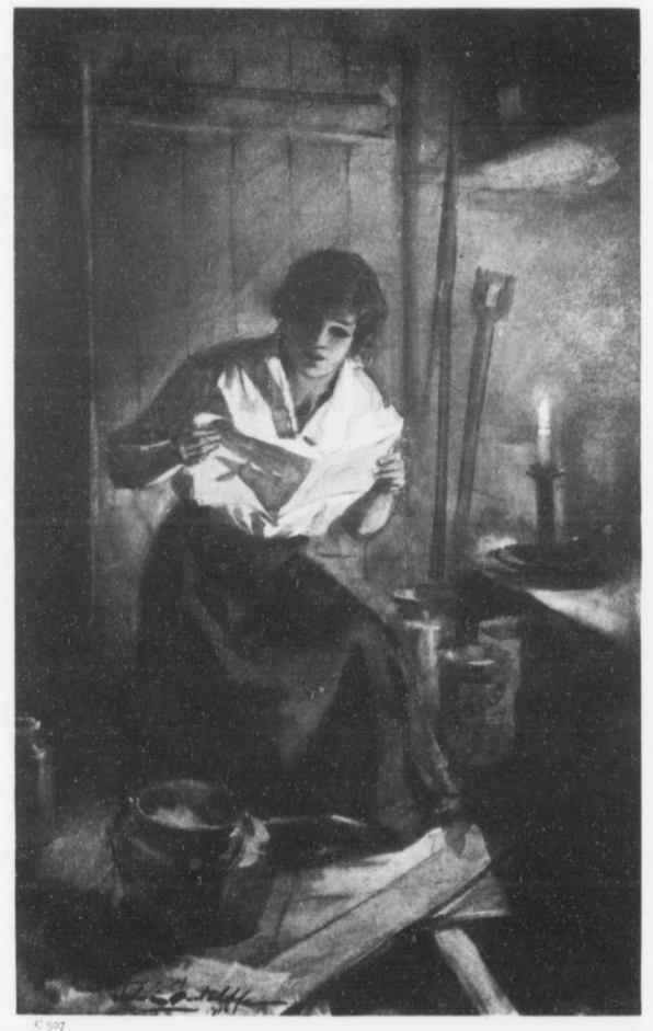
SUDDENLY A NAME CAUGHT HER EVE