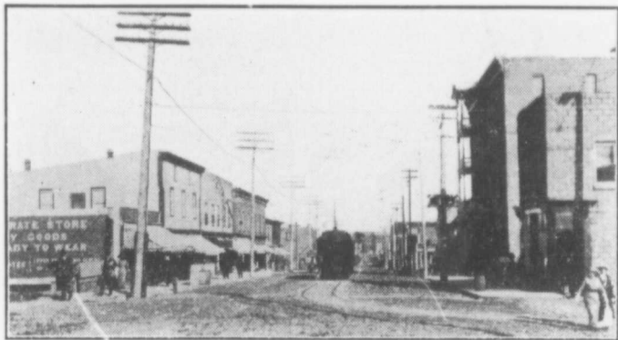
Whitewood Ave., New Liskeard