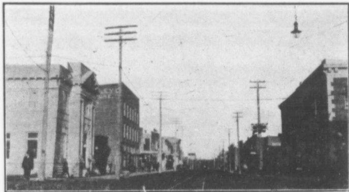
Armstrong St., New Liskeard