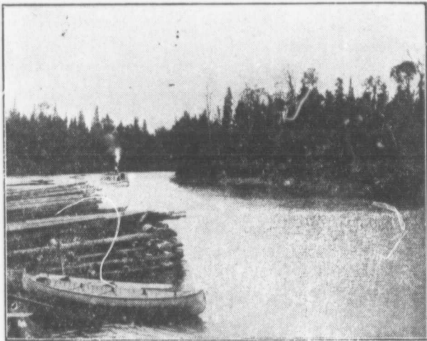
Temiskaming River Scene