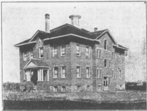
Public School, New Liskeard