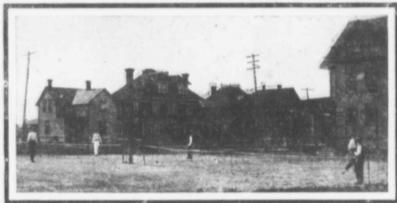
Tennis Court, New Liskeard

The Head Office of the Temiskaming Telephone Company is located here, which provides both local and long distance service, connecting with the T. & N. O. Railway Commission long distance service, which in turn connects with the Bell Telephone Co. at North Bay. The T. & N. O. Railway Commission Telegraph System is also available to the public.