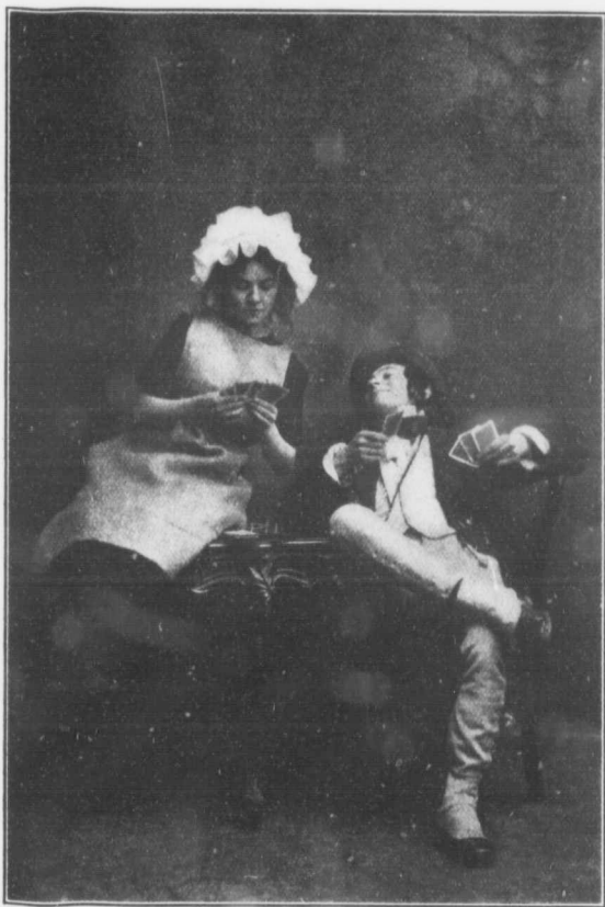
DICK SWIVELLER AND THE MARCHIONESS.