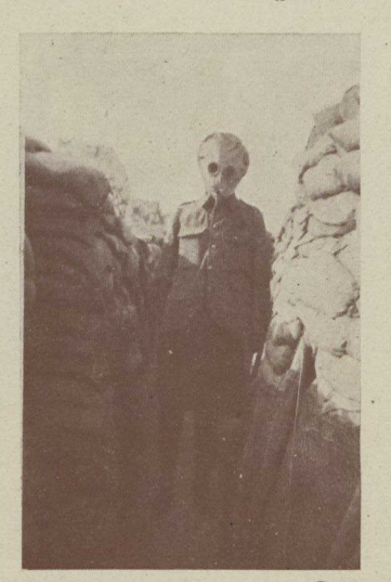
CANADIAN WEARING A GAS HELMET IN THE TRENCHES NEAR YPRES.

Patients who are suffering with lung or heart weakness as a result of "Poison Gas" are now also comparatively few here. The Germans seldom attack in force now, and seldom discharge gas in large quantities from cylinders or pipes as they used to, but when they now do so, the gas helmets and other