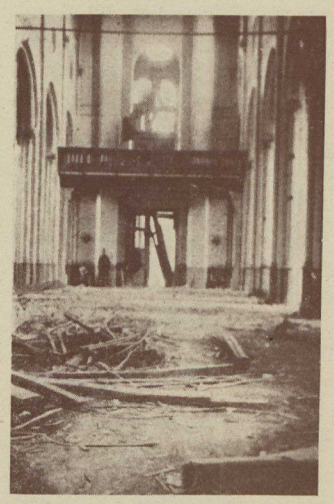
INTERIOR OF THE CHURCH IN THE VILLAGE OF PLOEGSTAET (NEAR YPRES) DESTROYED BY GERMAN SHELLS.

During the evening, in the Recreation Hall, Christmas Games, interspersed with Music, Songs, Recitations, etc., by members of the Staff and patients.