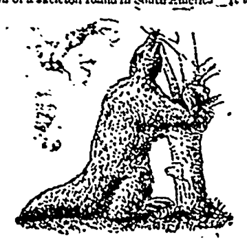
Fig. 11 - MEGATHERIUM (restored)

to now extinct, our engraving having been taken from a specimen restored according to the formstion of a skeleton found in South America _It was