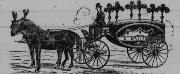
(Cut of our new Hearse.)