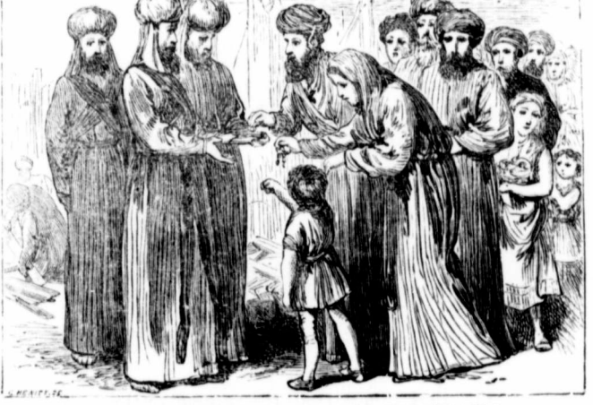
BRINGING OFFERINGS FOR THE TABERNACLE.

sleeping draught, which the flowerjuice contains, and drops dead upon the ground! If you were to walk round the tree with me, you would see the soft grass strewn with dead and dying bright winged insects! The Judastree reminds you and me of sin. Sin may look bright, pleasant, and attractive to our eves; we may think it "no harm" to indulge in it. But lurking behind "the pleas-