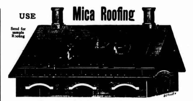
For Flat or Steep Roofs. It is Waterproof, Fireproof, quickly and very easily laid, and cheaper than other roofing. MICA ROOFING CO., 101 Rebecca Street, Hamilton, Canada