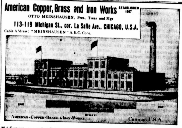
or complete Plants in any part of the world or Brewers. Distillers, Beet Sugar-Factories, Refineries, Glucose Works, Etc., Etc.

Builders of Complete Machinery for Beet, Cane and Glucose Sugar Houses and Refineries.