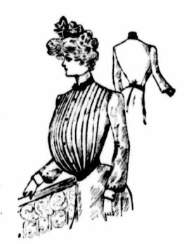
4180 Box Plaited Shirt Waist, 32 to 40 bust

Box plaits appear to gain in favor week by week and are seen in the latest and best designs. stylish waist shows them to advantage and is suited to all waisting materials, cotton, linen, silk and wool, but as illustrated is of white butcher's linen and is worn with a tie and belt of black Liberty satin. The original is unlined, but the fitted foundation is an improvement to wools and silks.