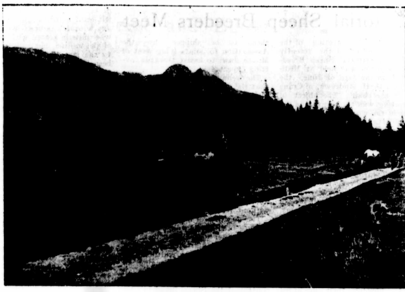
A Rural Scene in Newfoundland.