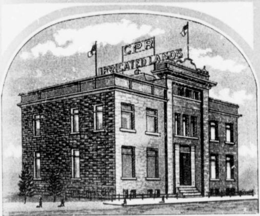
OFFICE BUILDING OF THE COMPANY CALGARY, ALBERTA