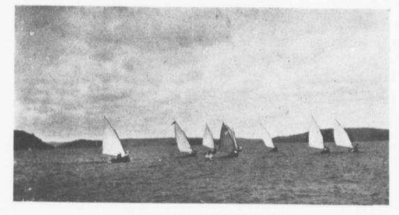
REGATTA DAY SAILING RACE