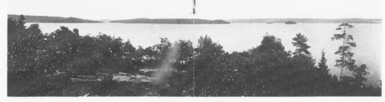
COTTAGE SITES AT CLOVELLY