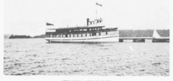
STEAMER "IROQUOIS" ONE OF THE BOATS WHICH CALL AT CLOVELLY