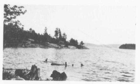
ROCKY POINT AND BATHING BEACH

Passengers leaving Toronto about 11.00 a.m. reach Clovelly about 5.30 p.m. or half an hour earlier than those bound for the "Wawa" at Norway Point.