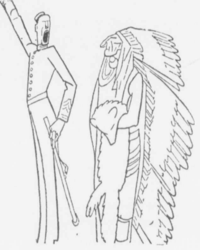
IN KANADA (Behold the German idea of a Canadian)

German have all come back. One cannot communicate with anyone outside Altheim. What a position! God in His mercy help us! It seems so strange to see German troops marching to the tune