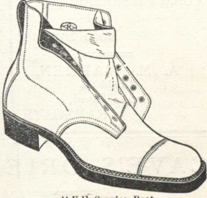
"K" Service Boot

ONE SHILLING = THREE MONTHS SUBSCRIPTION, MAILED ANYWHERE