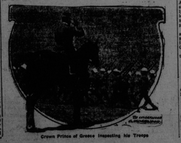
Crown Prince of Greece inspecting his Troops