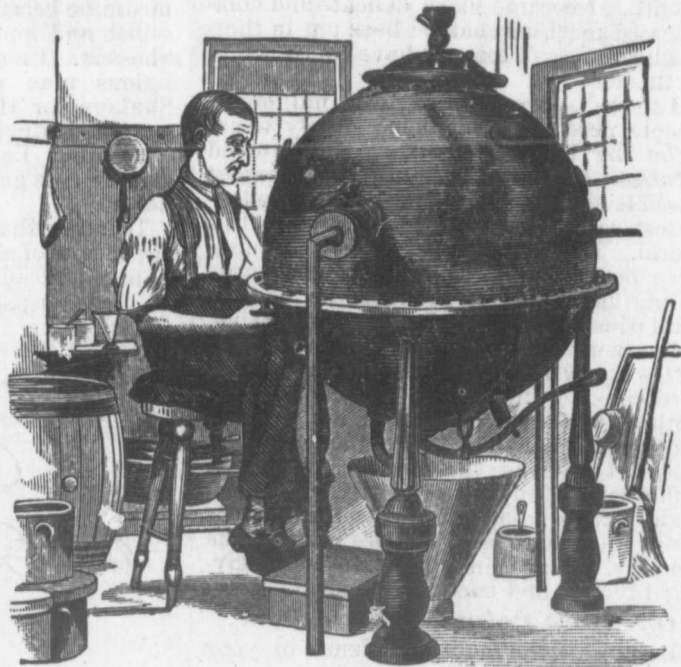
ALONZO HOLLISTER, THE FAMOUS SHAKER CHEMIST, CONCENTRATING MOTHER SEIGEL'S SYRUP, OR SHAKER EXTRACT OF ROOTS, IN VACUUM PAN, MOUNT LEBANON, N. Y.

When the Shakers put their name on an article you can rely upon it.