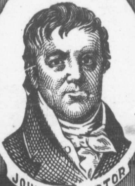
JOHN JACOB ASTOR