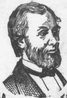
A. T. STEWART.