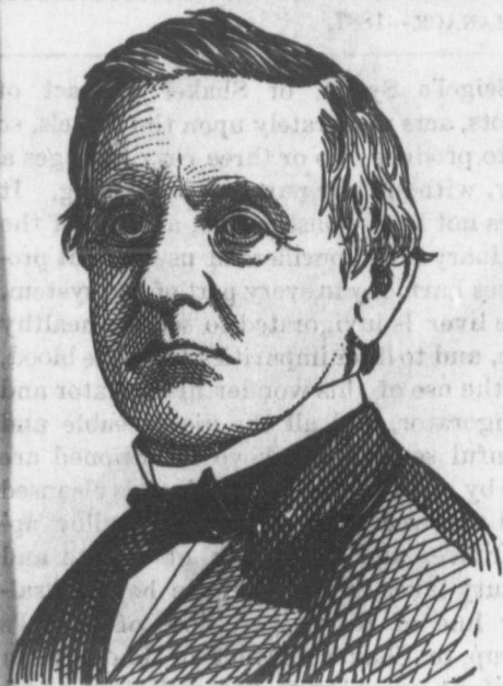
SAMUEL J. TILDEN.