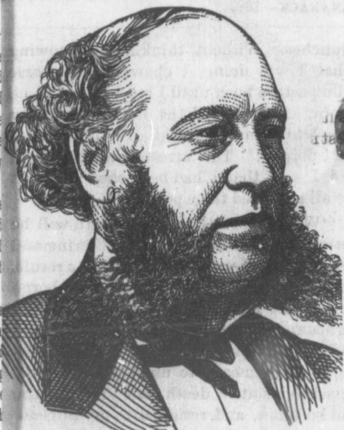
WM. H. VANDERBILT.