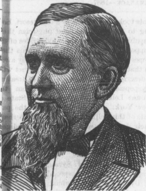
GEORGE M. PULLMAN.