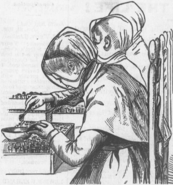
SHAKERESSES FILLING THE BOTTLES CONTAINING SEIGEL'S SYRUP, OR SHAKER EXTRACT OF ROOTS.