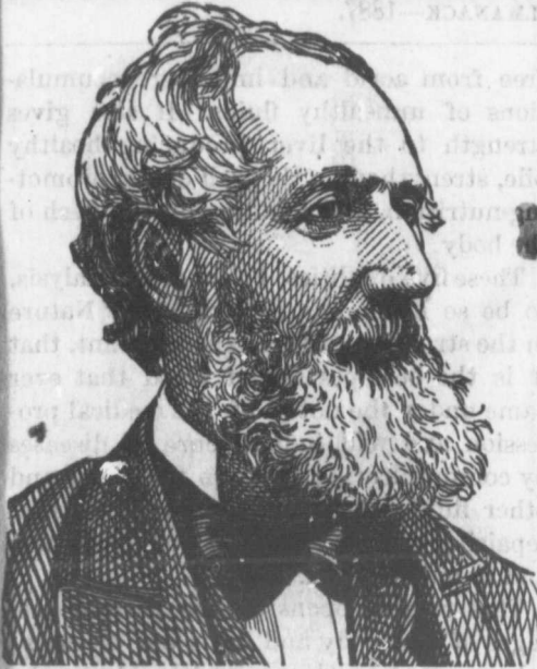
CYRUS W. FIELD.

With two great enterprises the name of Cyrus W. Field is inseparably associated: the Atlantic Cable and the elevated railroad system of New York city. Mr. Field was born in Massachusetts sixty years ago, but most of his life has been spent in New York. In 1858 the first cable was laid under the Atlantic. The cable broke three times, but at last Mr. Field had the satisfaction of superintending the transmission from President Buchanan to Queen Victoria of the first message, "What hath God wrought?" The same pertinacity which marked Mr. Field's struggle for the cable was displayed when the question of elevated railroads came up. With every detail of the work Mr. Field is familiar. Abroad, as well as in the United States, Mr. Field has an extended acquaintance among public men, and numbers among his friends the Prince of Wales, the Duke of Argyll, and Mr. Gladstone. He started the fund of $250,000 for the family of President Garfield and the one for the late Gen. Grant. Mr. Field belongs to a remarkable family. His brother, David Dudley, the eminent lawyer, is hale and vigorous, although more than eighty years old. Stephen J. Field, another brother, is a Justice of the United States Supreme Court, while Henry M., a clergyman, is a well-known religious editor. Mr. Field's manner is serious, but very polite.