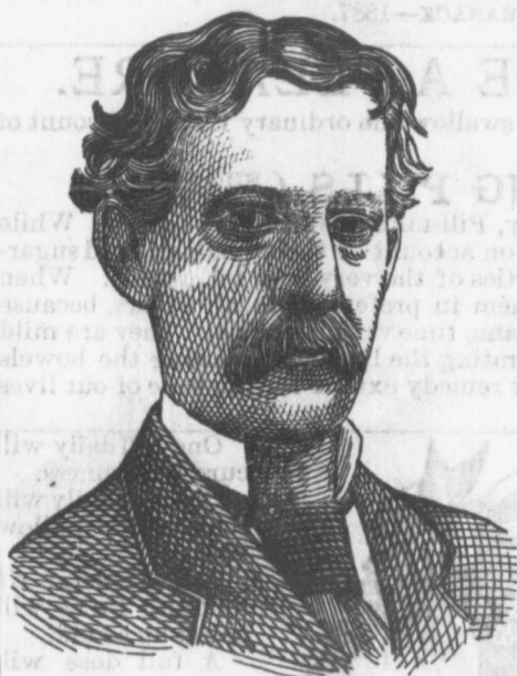
JAMES GORDON BENNETT.