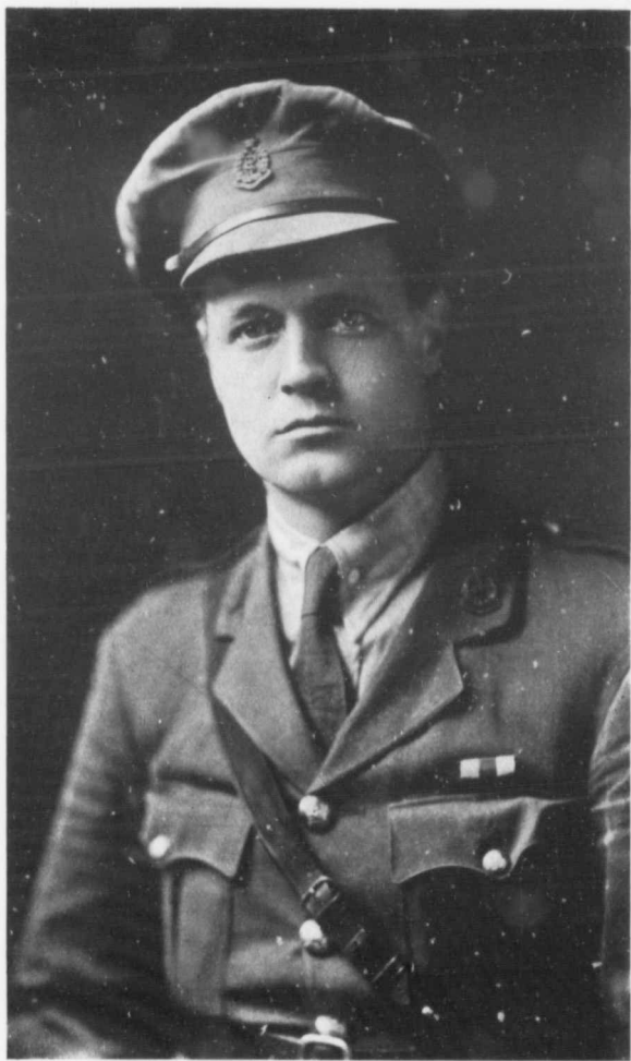
CAPTAIN R. J. MANION, M.C.