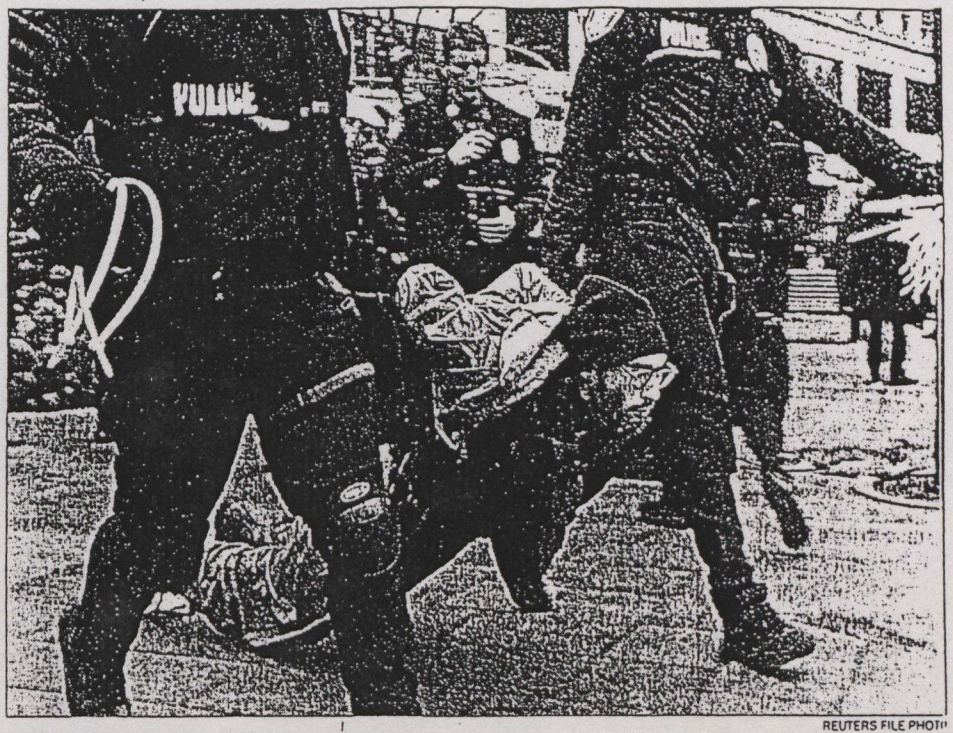
SEATTLE COMING TO WINDSOR? Protests are possible when the Organization of American States meets in Windsor next week. Street demonstrations and arrests, above, were a feature of the World Trade Organization meeting last year in Scattle.