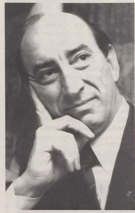
Finance Minister Marc Lalonde

Under the home ownership stimulation plan, $3 000 grants will be made