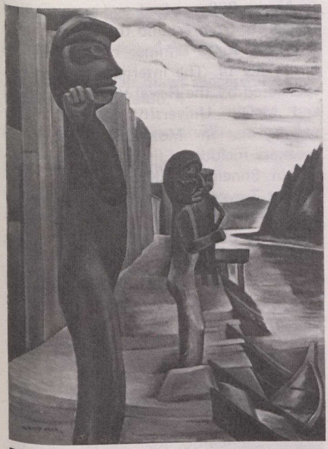
Blunden Harbour by Emily Carr, oil on canvas, circa 1930.

The program which is being organized and co-ordinated jointly by the Canada Council and the Department of External Affairs in Canada was determined in consultation with officials at the Akademie der Künste and is expected to cost more than $1 million. It is the most ambitious undertaking of its kind ever mounted abroad by the Canadian Department of External Affairs and includes a general information exhibit on Canada, a panorama of Canadian architecture, exhibitions of