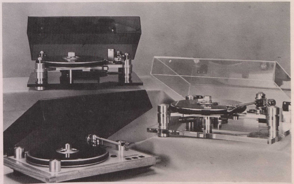
Until now, the turntable market has been generally dominated by "traditional" specialists such as the English and the Germans.

The "Alexandria", a popular low-cost model, is one of the new models built with moulded parts, thereby reducing its production cost. The "Studio" model is a luxury turntable model, which is completely hand-made, with individually-crafted parts and more advanced electronic controls.