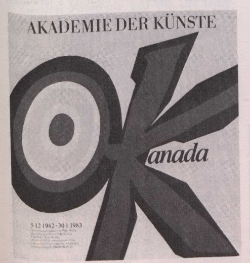
Poster for Canadian arts festival in West Berlin (see Page 7).