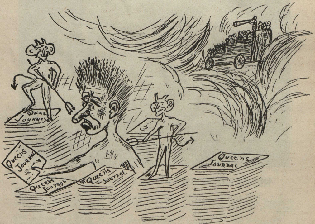
SEEING H—L. (Apologies to "Life.")

Scene—Alfred St. boarding house. (The landlady mounts the stairway to quell a disturbance in one of the rooms, in which she finds only two of the four boarders of the house).