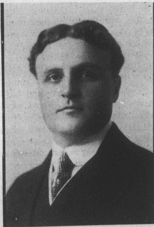
HON. T. D. PATTULLO Minister of Lands

In this time of unsettled convictions the public imagination is peculiarly sensitive to suggestion, and it is therefore particularly desirable that each of