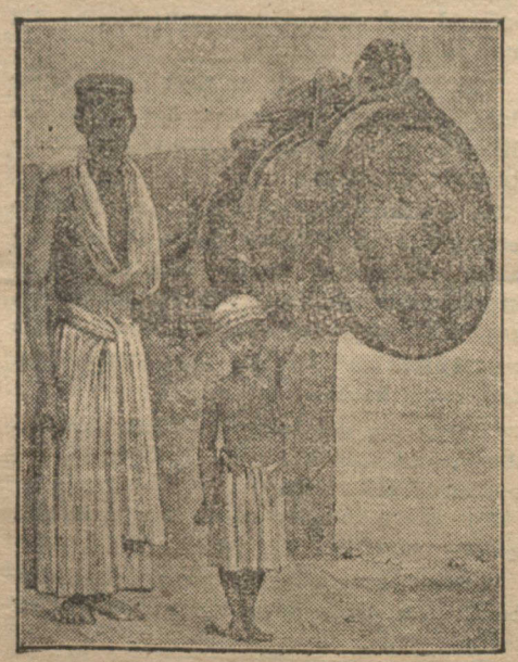
THE DUST OF OLD DACCA-AT THE CANNON'S MOUTH.

Where it came from originally no man seems to know. The oldest records of the city do not tell us, and the almost obliterated designs on the metal itself fail to give a clue. Some facts, however, have been ascertained. There were two guns, and they stood in front of a palace built