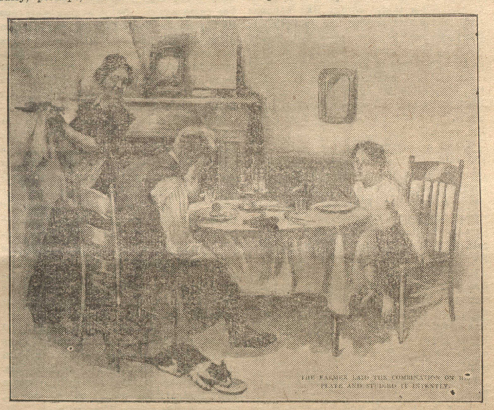
THE FARMER LAID THE COMBINATION ON HIS PLATE AND STUDIED IT INTENTLY

Out of school hours he fetched wood and water, went to the store and the post-office, attended to the thousand odd jobs that lie in wait for a boy on a farm, and seemed happily content withal. His foster-parents never had a doubt of him un-