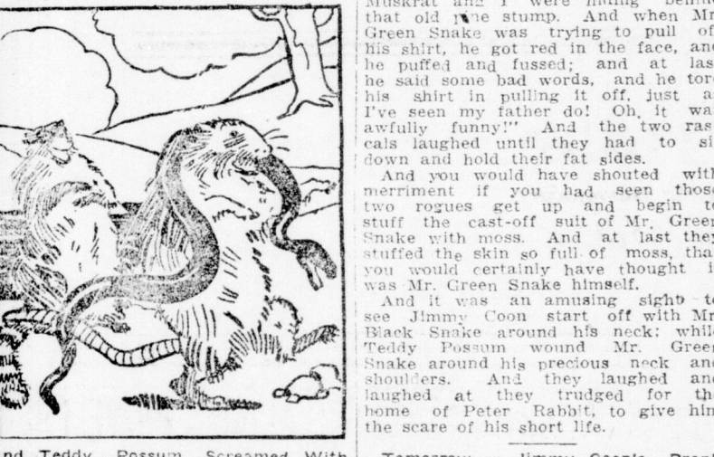
And Teddy Possum Screamed With Fear, and Almost Had a Fit.

Jimmy Coon and his old cast-off suit, which he had left in his cast-off suit of clothes.