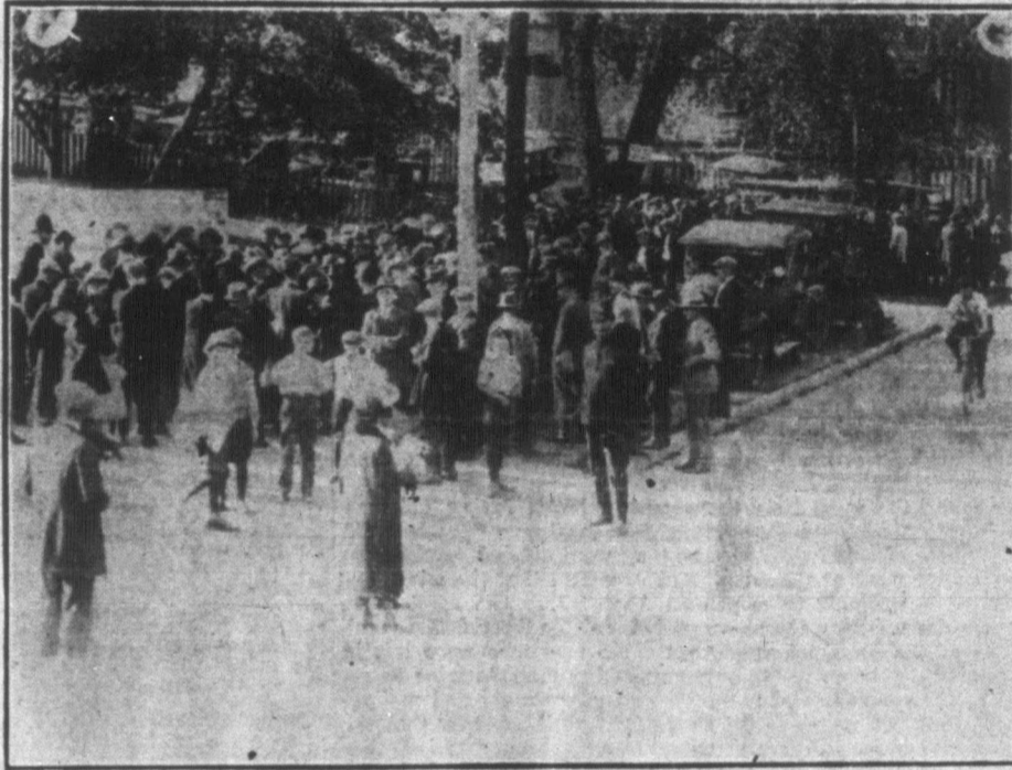
Crowd waiting for free admission to recent meeting at Dufferin Park after 5 o'clock—Ontario Government decided that no tax should be charged on free admissions.